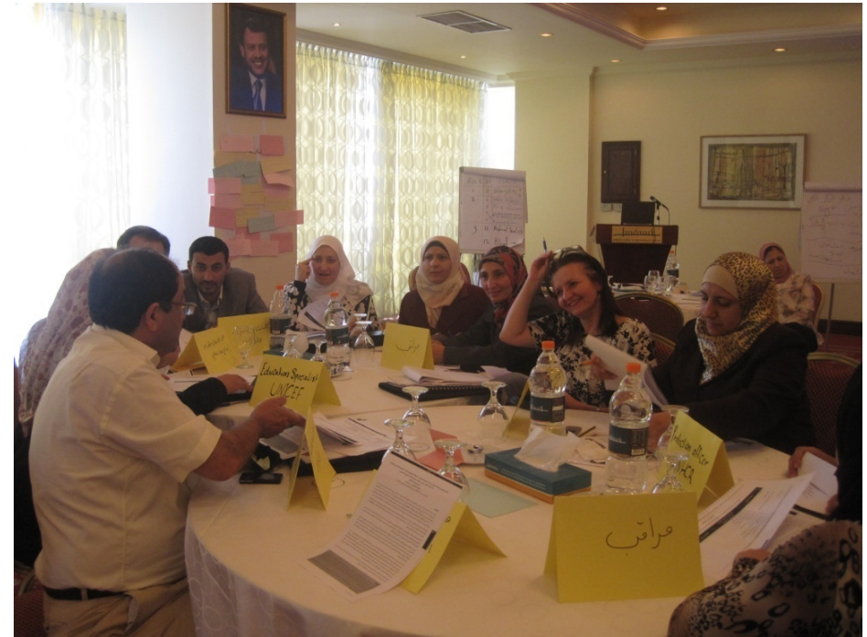
MISP TOT: echo training Participants, Jordan