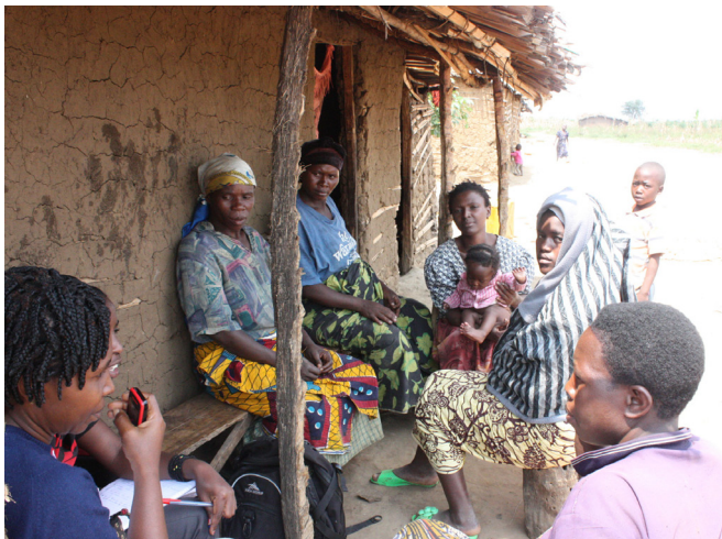
Women in the community gathered for a group discussion.

We visited Uganda to examine the extent to which refu-